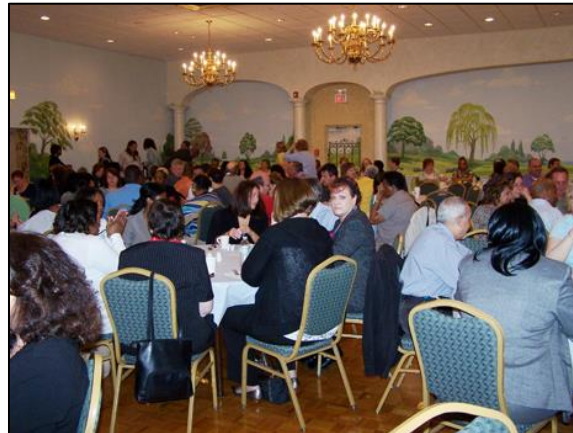
Department of Labor Recognition Ceremony

“The deepest principle of human nature is the craving to be appreciated.”