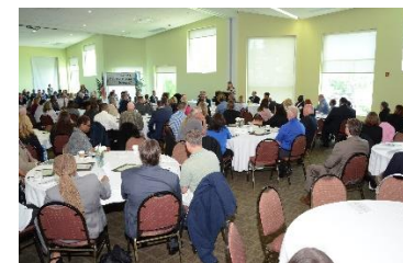
Attendees at the 2017 Delaware Governor’s Awards Ceremony: Recognizing State Employee Individuals, Teams, and Heroes