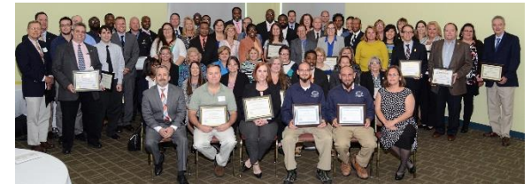
Past nominees and recipients of the Delaware Award for Heroism, the Governor’s Team Excellence Award, and the Delaware Award for Excellence and Commitment in State Service

The thousands of dedicated individuals who make up the State of Delaware’s workforce are our most important and valuable resource.