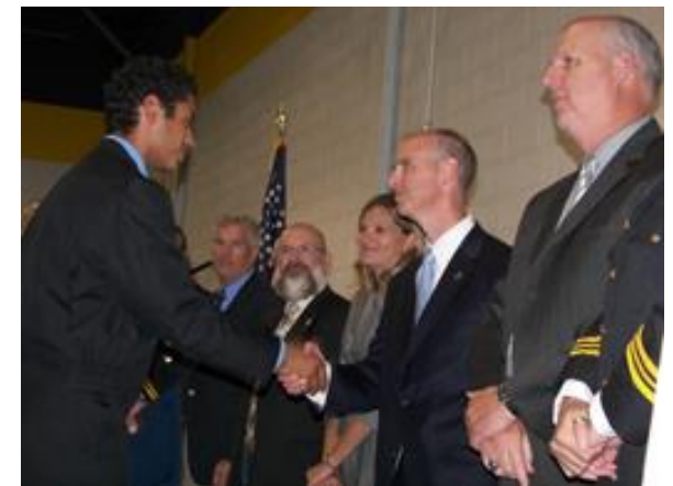
Department of Corrections Program